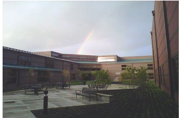
Wapakoneta High School

Impact: Better performing systems and savings in excess of $30,000 per year.